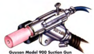
Guyson Model 900 Suction Gun